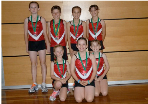
Mackay's Alligator Creek team at their first Nationals